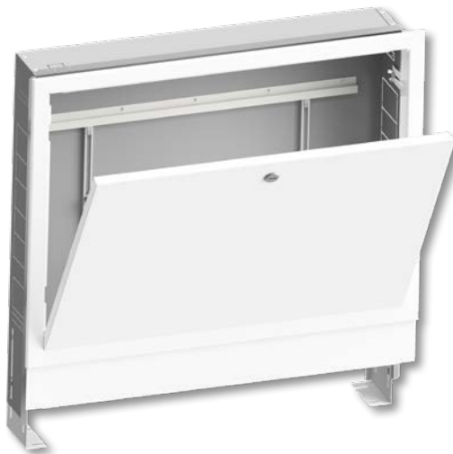
Mounted manifold cabinet in wall

The cabinet has a reinforcing profile and removable pipe guide. There are adjustable mounting rails for heights of the manifolds between 690 – 800 mm. The depth can be adjusted from 110 to 160 mm. It can thus be adapted to the wall conditions at any time.