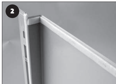
2 Attach sealing