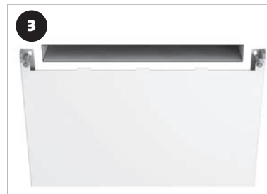
3 See MANUAL for Air Installation