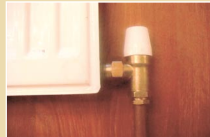
lock-shield valve fitted bottom opposite end