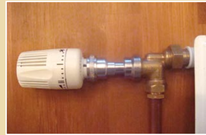
with sensor head attached (the sensor head would be outside of the case)