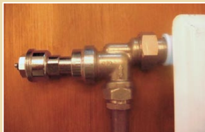
with extension piece